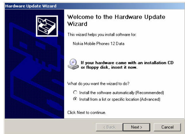
2 fig. New hardware dialog